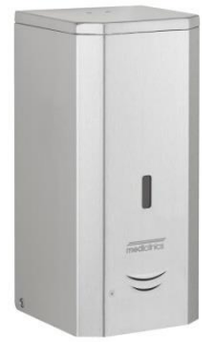
DJ0037ACS Satin finish