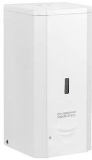
DJ0037A White epoxy finish