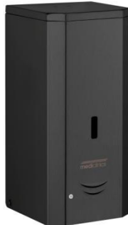
DJ0037AB Black epoxy finish