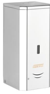
DJ0037AC Bright finish