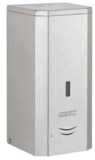
DJF0038ACS Satin finish