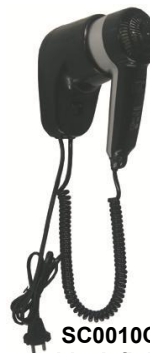
SC0010CS black finish