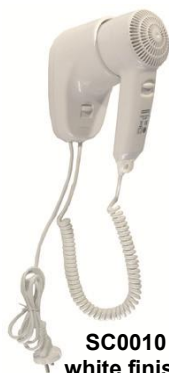
SC0010 white finish