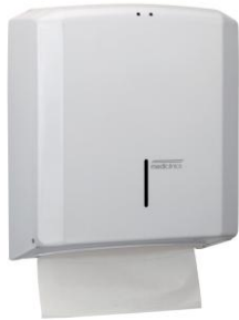
DT2106 White epoxy finish