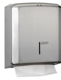
DT2106CS Satin finish