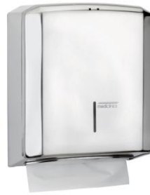
DT2106C Bright finish