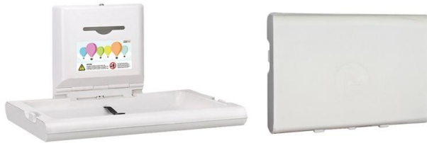
CP0016H Polypropylene white finish