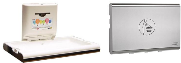
CP0016HCS Polypropylene /Stainless steel satin finish