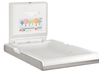
CP0016VCS Polypropylene /Stainless steel satin finish