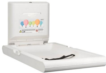
CP0016V Polypropylene white finish