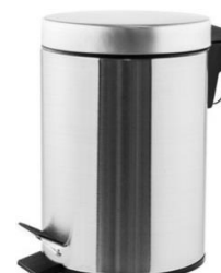
PP1303CS/PP1305CS/PP1312CS/PP1321CS Satin finish