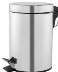
PP1303C/PP1305C/PP1312C/PP1321C Bright finish