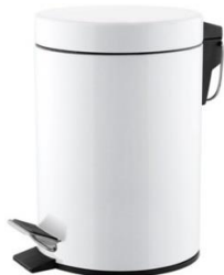
PP1303/PP1305/PP1312/PP1321 White finish