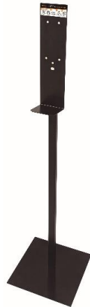
HGPT0020B Matte black epoxy finish