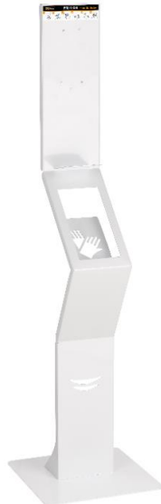
HGPT0040 White epoxy finish