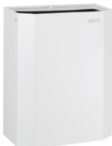
PPA2279 White epoxy finish