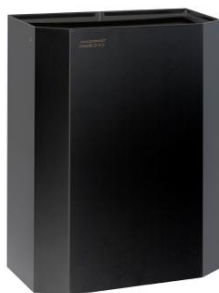
PPA2279B Black epoxy finish