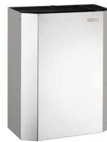
PPA2279CS Satin finish