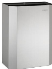
PPA2279C Bright finish