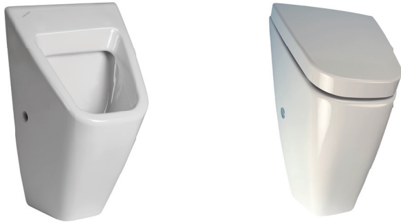
SLP 12 - VILA WITHOUT A COVER SLP 37 - VILA WITH A COVER